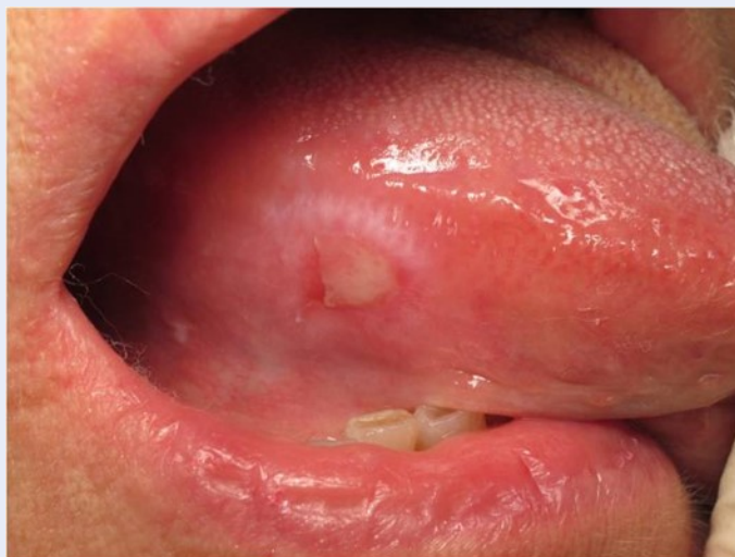
Figure 2: Verrucous leukoplakia of the lower lateral surface of the tongue on the right. Patient A., the status on the 5 th day after cryodestruction.

* statistically significant differences between patients of two groups.