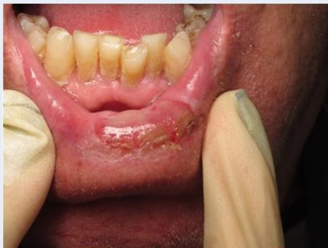
Figure 3: Verrucous leukoplakia of the red border of the lower lip. Patient B., the status on the 5 th day after cryodestruction.