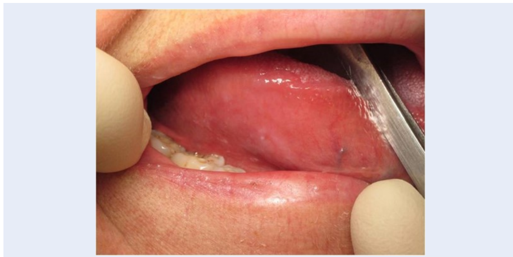
Figure 4: Verrucous leukoplakia of the lower lateral surface of the tongue on the right. Patient A., the status on the 10 th day after cryodestruction.

* statistically significant differences between patients of two groups