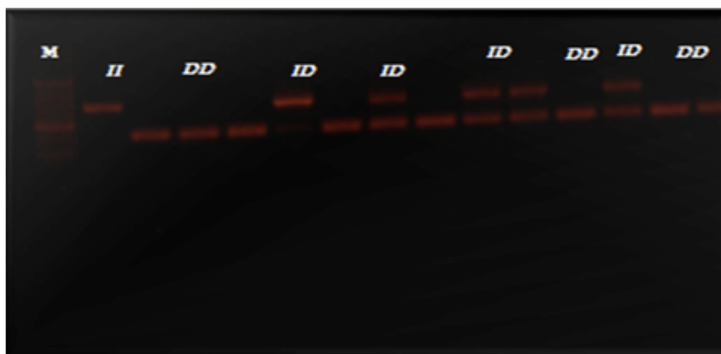
Figure 1. ACE gene PCR products in agarose gelelectrophoresis.

PCR against the ACE gene polymorphism was applied to detect ACE genotypes, 490 bp amplicon size was detected with I/I genotype and 190 bp amplicon to D/D genotype and the presence of two bands 490 bp and 190 bp showed the I/D genotype, as shown in Figure 1 . A negative control (with nuclease-free water instead of the DNA template) was included in each reaction. The size of the amplicon was estimated by comparing it with a DNA molecular size marker (50 bp ladder DNA) run on the same gel.